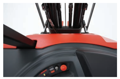
An angled front cover enhances visibility so that operators can see what they are moving, right down to the floor.

*Results based on data compiled in the 2011 United States Auto Club (USAC) Comparative Data Report, Raymond Model 4250-R40TT and competitor's comparative unit. For further details on specifications of models tested and test cycles, please refer to the USAC Comparative Data Report, item ITRG-1005.