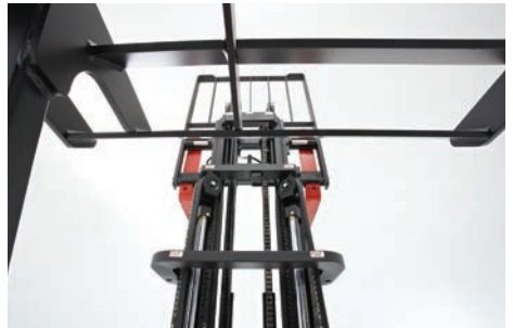
Operators will experience a clear view for more efficient handling and stacking

ComfortStance Suspension enhances operator comfort throughout every shift, isolating the operator from impacts and delivering a smooth ride over dock plates and uneven floors.